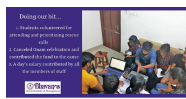
prioritizing them, working continuously for up to 24 hours. The students considered this opportunity to

The staff and students of Bhavan's B-School in association with 'Anbodu Kochi', Rotaract Club of Cochin East and Rotary Kochi United, volunteered for the Ernakulam collector's call center. The students displayed excellent maturity and commitment in attending and analyzing calls and