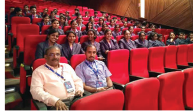
Faculties and students participating in the annual management convention of KMA