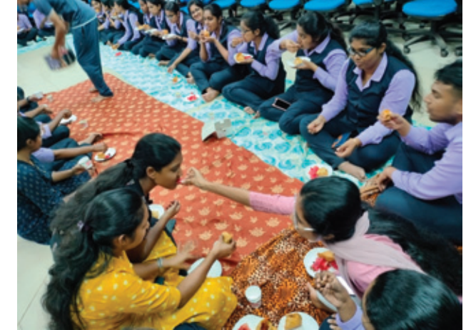
Iftar in the Campus