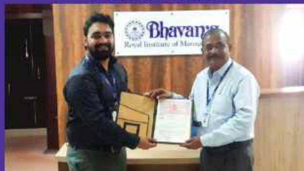
MoU with NSE on Knowledge Sharing